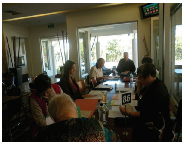
. . . Area 34 Council Meeting in August. Other 'Desperados' joined in, and it turned out to be a very productive meeting.