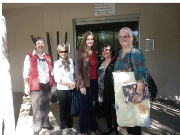
Five 'Female Desperados' swooping down on the Helensvale Tavern at 10 am on a Saturday morning waiting for the Pub to open, for an early morning . . .