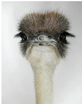
'I'm listening . . .'